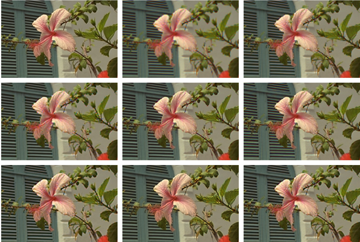
Figure 3. Demosaicing results for various interpolation algorithms. From left to right; top row: original, bilinear, Freeman [2],[5]; middle row: Laroche-Prescott [2],[6], Hamilton-Adams [6],[7], Chang et. al. [8]; bottom row: Pei-Tam [4], Kimmel 0, and our proposed method.