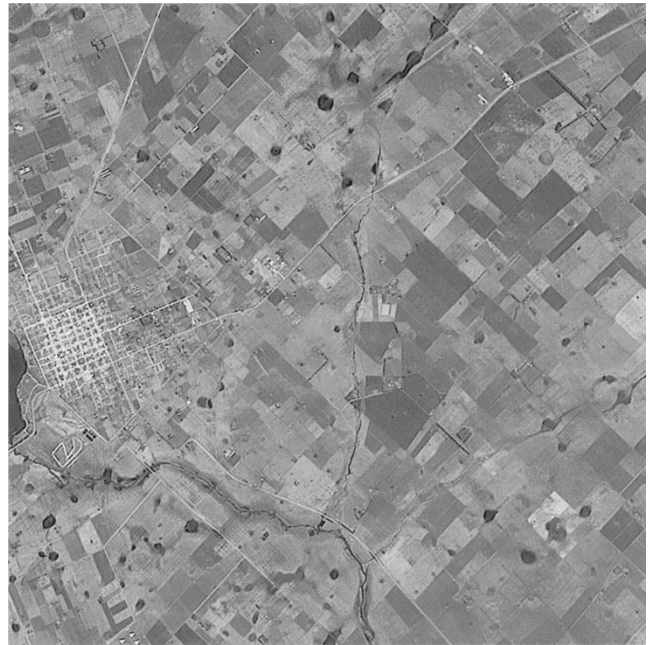
Fig. 1. Detail of the SPOT image.

The last four lines of Table I show the correlation between the R, G, and B bands of the additive wavelet-based solutions (AWRGB, AWI, AWL', and AWL) and the same bands of the original LANDSAT (TM) at 30-m resolution. Note that the correlations of all the additive wavelet-based solutions are clearly higher than the correlations of the standard solutions. This means that the additive wavelet solutions preserve the spectral characteristics of the multispectral image to a greater extent than the standard IHS, L'HS, and LHS solutions.