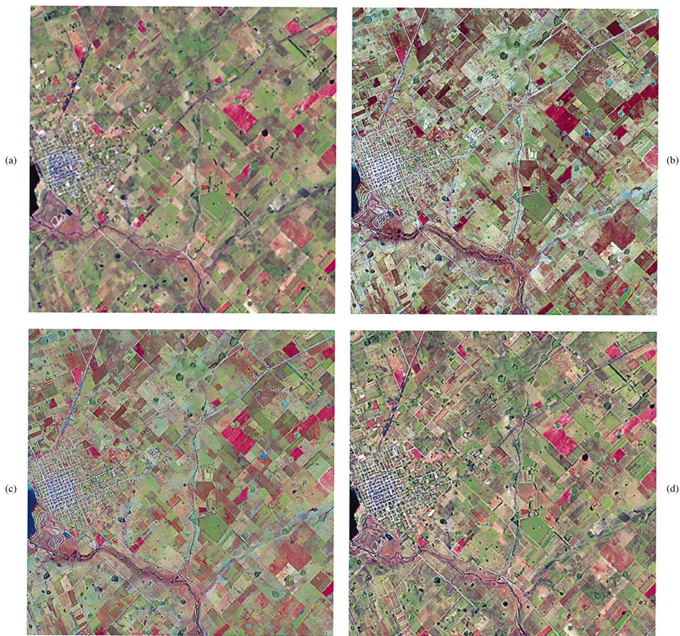
Fig. 2. (a) Detail of the LANDSAT (TM) image. (b) Result of the fusion by the standard IHS method. (c) Result of the fusion by the standard LHS method. (d) Result of the fusion by the additive wavelets on L component (AWL) method.

and rivers. The images were registered and the SPOT image was photometrically corrected to present a histogram similar to the L component of the LANDSAT image. Then, we applied the AWL image fusion technique and compared the results to those given by the standard methods.